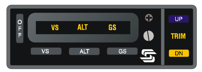
Fig. 3-1. System 60 PSS Programmer/Annunciator

The System 60 Pitch Stabilization System (PSS) is a rate based autopilot that provides control of the pitch axis of the aircraft. Pitch axis control is provided by deriving vertical speed, altitude position, altitude error and rate of vertical speed (acceleration) from the absolute pressure transducer.