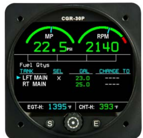
Fuel Qtys Screen