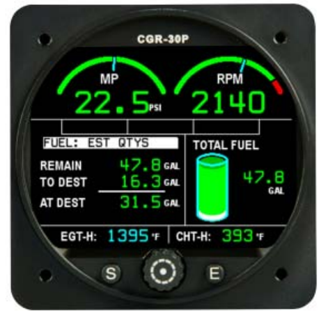
Fuel Data Screen

User Setup Screens (see section 6.0): The User Setup Screen Menu provides a list of setup screens for setting the K-Factor, setting clocks, viewing the Tach and Engine Hours, setting the display range for the bar graph, downloading recorded data and setting up the Recurring Fuel Alarm.