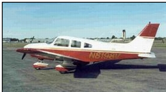
N8198V 1982 PIPER WARRIOR II

The Piper Warrior is a four seat, well maintained IFR equipped fixed gear aircraft. Avionics include a Garmin 300XL IFR GPS, a King KX155 NAV/COM radio with glide slope and DME. It is a great platform for primary and advanced training or just to build time.