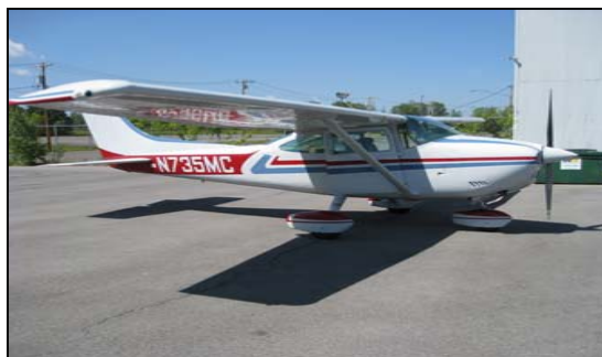
N735MC 1977 Cessna 182Q Skylane

The Piper Warrior is a four seat, well maintained IFR equipped fixed gear aircraft. Avionics include a Garmin 300XL IFR GPS, a King KX155 NAV/COM radio with glide slope and DME. It is a great platform for primary and advanced training or just to build time.